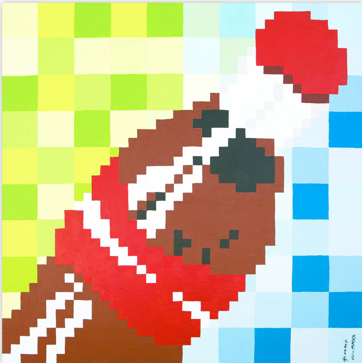
acrylic on wood | title "the biggest" | 100 x 100 cm