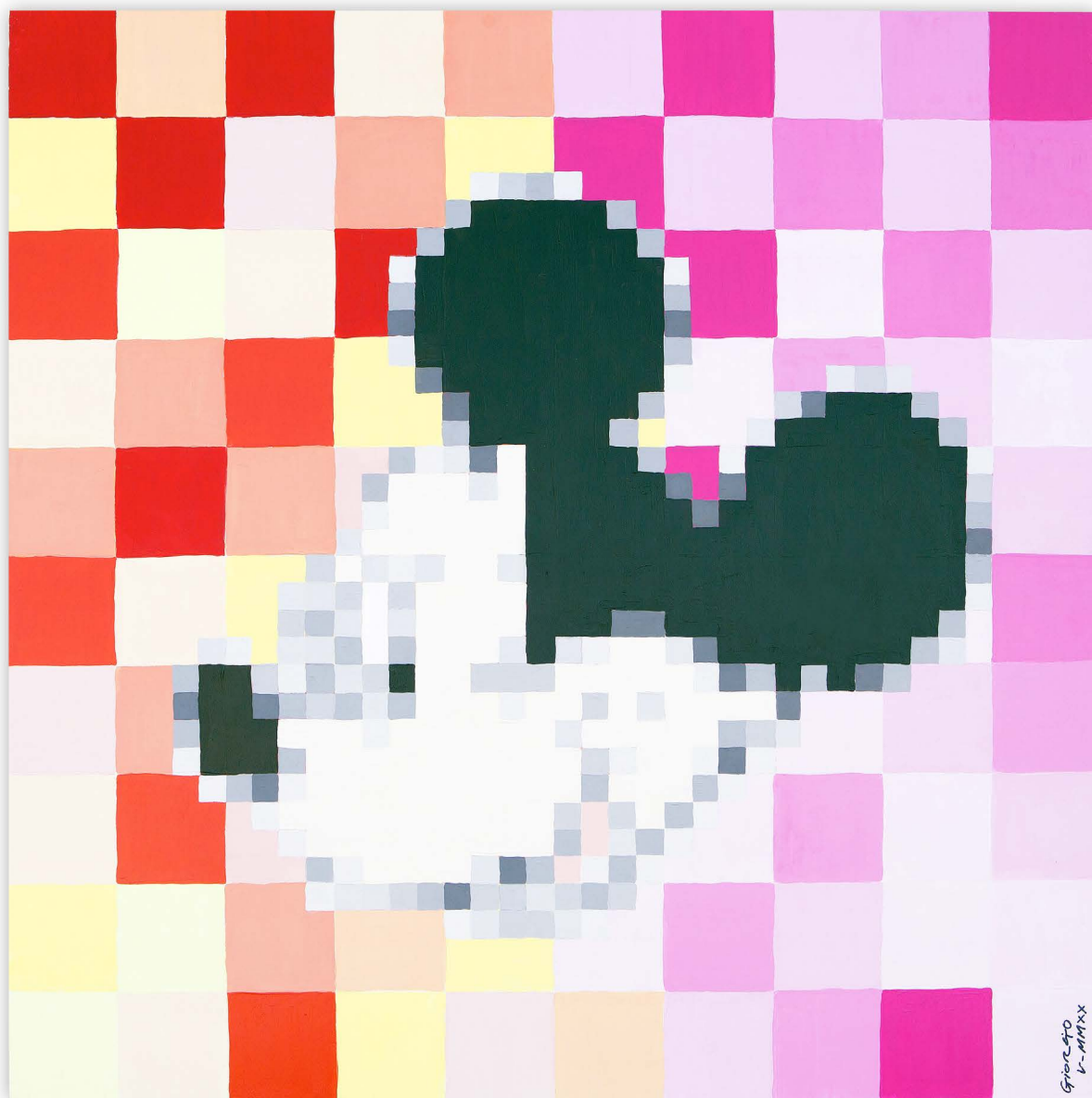
acrylic on wood | title "portrait" | 100 x 100 cm